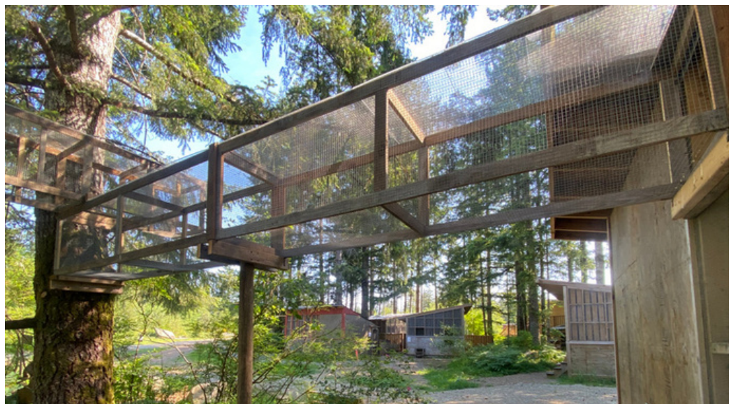
Brand new crow-walk!

Two of our Ambassador Birds, our beloved albino crows Nimpkish and Kokish, are enjoying some new architecture. Our two melanistically challenged corvids have enjoyed their pen-air popouts (also known as 'poop-outs') for over a year now, but were in for a treat when our construction crew installed a mega-pop out. Come check out the crows and maybe if you're lucky, you'll see them on their "crow-walk".