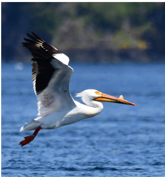
American White Pelican evading capture

Our top reasons for admission continue to be window strikes, cat attacks, and vehicle impacts. Regarding windows in particular, if you are encountering this problem at your house, please come by the Visitor Centre or email me at education@marswildliferescue.com for some potential solutions. With the number of patients brought in and anecdotes from tour guests, window strikes are clearly a widespread problem that can often be reduced by treating our windows.