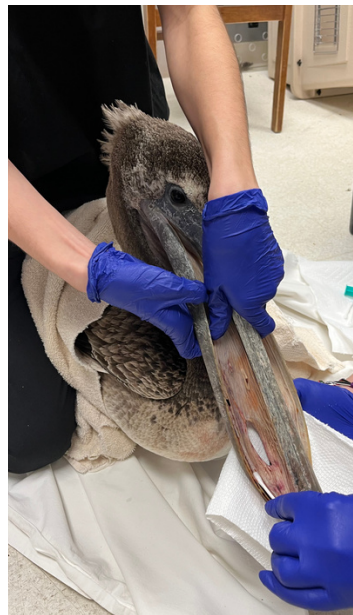
Brown Pelican with pouch puncture