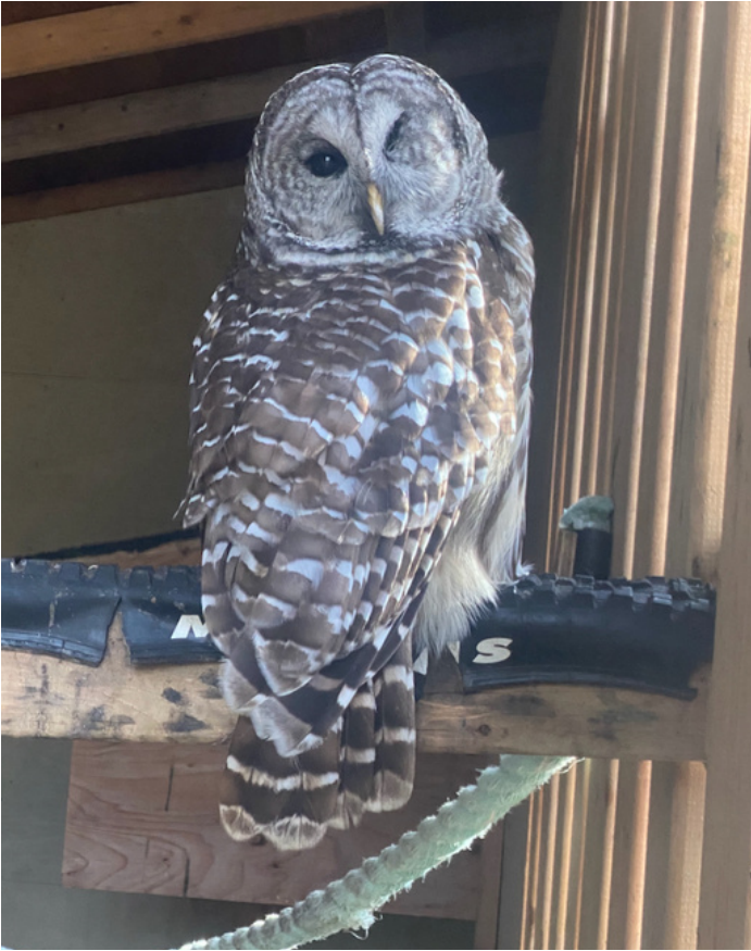
SHAKESPEARE AMBASSADOR FROM 2005-2023